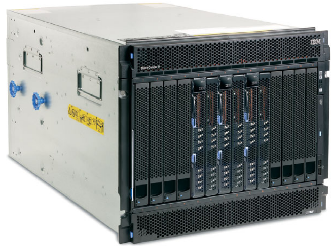
BladeCenter H with PS Blades

Simplify. Cut costs. Boost productivity. Go green. They're all priorities for IT, and they're all driving organizations to rethink their server strategies and become more receptive to new ways to use IT. Blades are the next-generation solution, promising improvements across the board. So toss your cables and take the leap. Migrate to the blade solution that uses less energy and gives more choices and control. You have nothing to lose but complexity. IBM BladeCenter is the right choice. Open. Easy. Green.