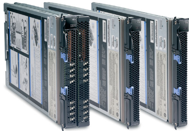
PS Blade Family

If you are looking for the perfect alternative to replacing traditional rack servers, then look no further. With a range of available PS blade choices and BladeCenter chassis supported you have the performance and scalability you need for demanding workloads of any sort. When combined with the BladeCenter S chassis, the PS blades become an ideal solution for deploying blades in an office and distributed enterprise environment. Unlike a stand-alone server that needs multiple power supplies and fans, individual systems management, numerous cables and a lot of space, IBM BladeCenter is compact and easy to use. By integrating servers, storage, networking and management, BladeCenter is helping companies in every industry sweep complexity aside.