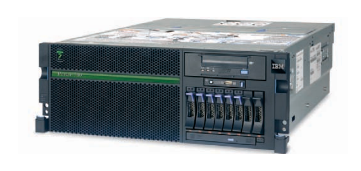
Power 740 Express rack-mount server

The Power 740 Express is a one- or two-socket server that supports up to 16 POWER7+ cores in a flexible 4U rack-optimized form factor. The Power 740 offers large memory capacity, outstanding performance of the POWER7+ processor, PowerVM and workload-optimizing capabilities to enable companies to get the most out of their systems by increasing utilization and performance while helping to reduce infrastructure and energy costs. The latest model of the Power 740 Express adds increased memory capacity, higher performance POWER7+ processors, and high bandwidth Generation 2 PCI-Express slots to provide even greater performance capabilities.