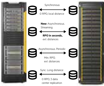
Figure 4: One software license for simple, efficient, and flexible disaster recovery