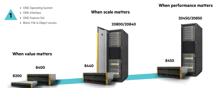
Figure 1: HPE 3PAR StoreServ Storage Models

With support for asynchronous streaming replication, you'll be able to dramatically reduce the cost and complexity of data protection with disaster recovery that can be set up and tested in only minutes and is supported across all models in the HPE 3PAR StoreServ Storage family (figure 1). HPE 3PAR StoreServ 20000 also supports flat backup to HPE StoreOnce Backup appliances for simple and efficient data protection that eliminates traditional backup processes.