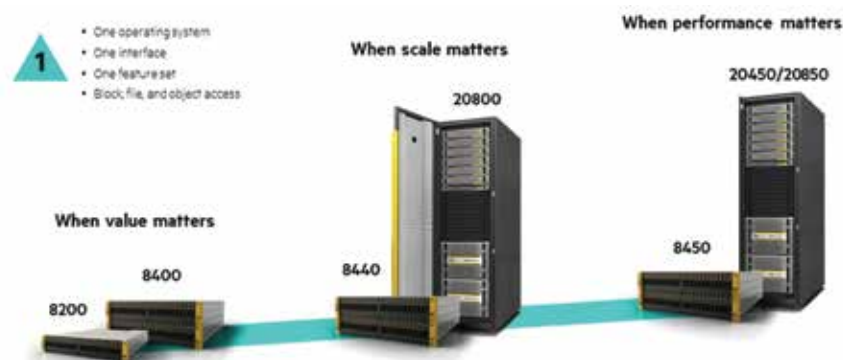
Figure 1: HPE 3PAR StoreServ Storage models

You'll be up and running in just minutes, meeting mixed workload demands with improved service levels and virtually unlimited scalability options. You'll spend less time managing your storage with converged block, file, and object access from a single interface. You'll maintain high availability through a complete set of persistent technologies and have the option of simple and efficient data protection with flat backup to HPE StoreOnce Backup appliances. You'll rid yourself of tradeoffs that have forced you to sacrifice critical capabilities like all-flash performance for scalability and Tier-1 data services.