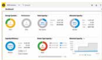
Figure 2: The HPE 3PAR StoreServ Manage Console (SSMC) dashboard view provides health, performance, and capacity at a glance for up to 16 HPE 3PAR StoreServ arrays of any model