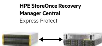
Figure 3: Simplify backup and restores with application-aware, storage-integrated data protection

See the results from the Demartek Evaluation Report All-Flash HPE 3PAR StoreServ 7450 Storage System and Generation 5 (Gen5) 16 Gbps FC .