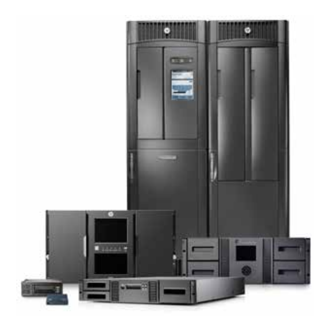
HPE StoreEver LTO Ultrium Tape Drives