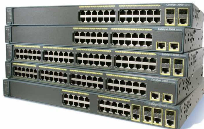
Figure 1. Cisco Catalyst 2960 Series Switches