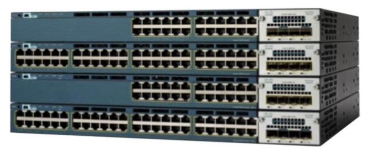
Figure 2. Cisco Catalyst 3560-X Series Switches

Figure 2 shows Cisco Catalyst 3560-X Series Switches.