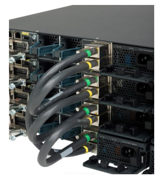
Figure 3. StackPower Connector

The Cisco Catalyst 3750-X Series introduces Cisco StackPower technology, innovative power interconnect system that allows the power supplies in a stack to be shared as a common resource among all the switches. Cisco StackPower unifies the individual power supplies installed in the switches and creates a pool of power, directing that power where it is needed. This feature is available in all Cisco Catalyst 3750-X Series Switches feature sets<sup>*</sup>. Up to four switches can be configured in a StackPower stack with the special connector at the back of the switch using the StackPower cable<sup>**</sup>, which is different than the StackWise cables. (See Figure 3.)